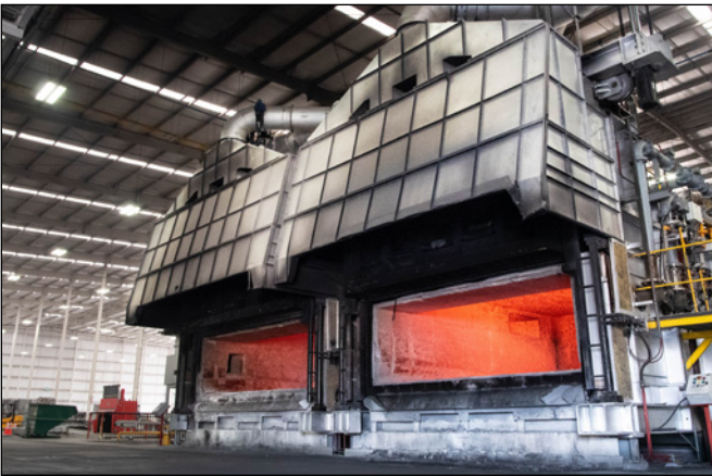
Figure 3. The dual chamber melting furnace efficiently preheats and melts a variety of scrap and prime materials.

The contaminated scrap material is loaded into the dry hearth chamber, which is outfitted with two high velocity burners for optimal delacquering and preheating of the scrap. Any contaminants are pyrolysed and combusted in the main chamber, which substantially reduces the melting energy input required. This both improves the efficiency of the furnace and ensures the purity of the aluminum.