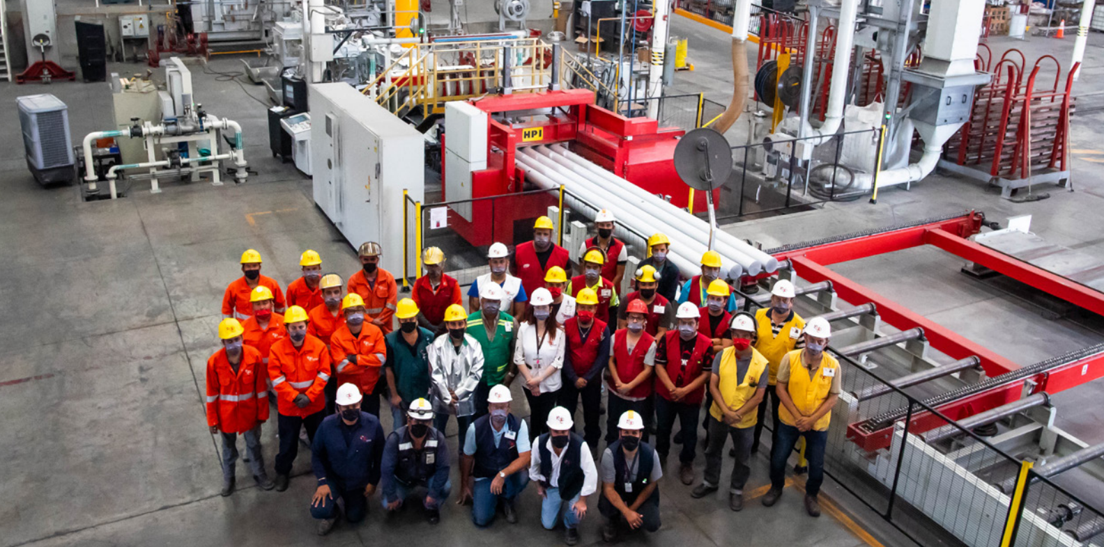
The ABC casthouse team stands in front of the new remelt and casting operation.