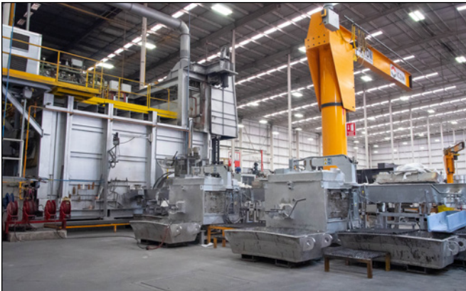
Figure 7. The degassing and filtration area ensures proper aluminum purity prior to casting.

After the aluminum is fully melted and ready for casting, it is transferred to the 35 ton holding furnace using a tap out system. The holding furnace maintains the temperature of the melt and keeps the liquid level constant during the entire continuous casting process. Presezzi selected GDS Engineering in Italy to provide the degassing, filtration, and trough system, which ensures metal purity prior to casting (Figure 7).