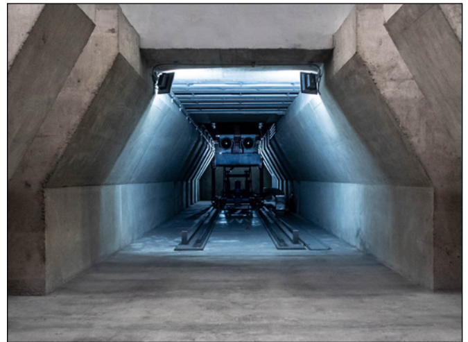
Figure 5. A magnetic stirrer is installed under the melting furnace to provide chemical and temperature homogeneity.

The metal within the furnace is stirred using Presezzi’s patented Low Energy Consumption (LEC) stirrer, which creates a rotating magnetic field that continuously circulates the molten bath between the two furnace chambers (Figure 5). Compared to a traditional electromagnetic system, the magnetic stirrer doesn’t require an expensive water cooling system, water treatment plant, or insulation transformer. It is 100% air cooled and features a low energy consumption of only 26 kW (compared to 105 kW with a conventional system). The circulation between the two chambers ensures the thermal and chemical uniformity of the bath, while also increasing the melting capacity, speeding up the alloying process, and reducing dross generation.