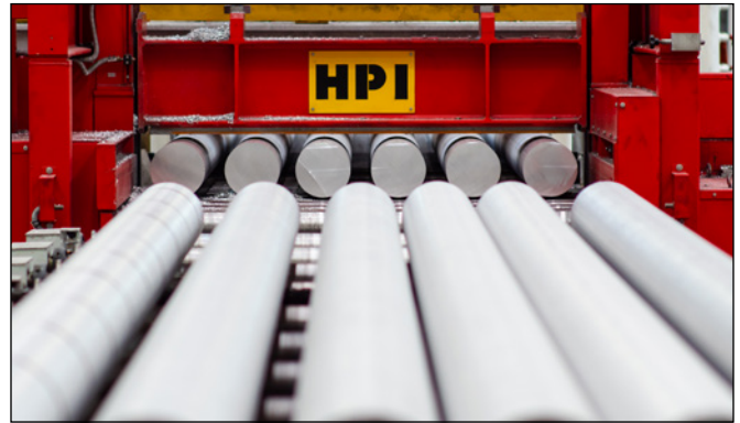
Figure 8. Billet is cut to length during the continuous casting process using a flying saw.

The horizontal casting machine from HPI GmbH, based in Austria, enables ABC to continuously cast high quality billet. The casting machine includes a heavy, machined base frame together with a proven tundish design and mold geometries. The tundish includes height level adjustment and blocking protection to prevent spillage, as well as a design that allows for easy assembly, disassembly, and centering of the casting heads. The casting machine also features independent mold lubrication pumps for the distribution of water and oils, efficient smooth cutting via a flying saw (Figure 8), and motor and chain-controlled outfeed conveyors. The machine is designed to cast six 7 or 8 inch billet at a time or five 10 inch billet, with a maximum length of 7.5 m and an average production rate 2.7–3.3 tons/hour, depending on the diameter. A data acquisition system monitors the casting process to ensure the production of high quality extrusion billet with optimum efficiency and long equipment life.