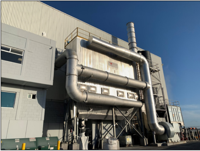
Figure 6. A dedicated fume treatment plant was installed to reduce the environmental impact of the recycling process.

European aluminum market. As a result, ABC will be able to operate one of the most ecologically friendly remelt plants in Latin America.