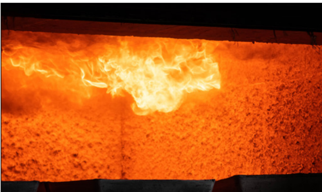
Figure 4. Two oxy-fuel burners are installed in the roof of the melting furnace to provide rapid melting without causing hot spots.

Once delacquering and preheating is completed, the load is pushed into the metal bath and quickly submerged. A melting rate of 5 tons per hour is achieved through the implementation of advanced technologies, such as oxy-fuel burners and magnetic stirring. Two oxy-fuel TURN-FLAME burners (with a thermal power of 6.4 MW/h) are installed in the roof of the hot melting chamber (Figure 4). The mixture of pure oxygen and gases enables the burners