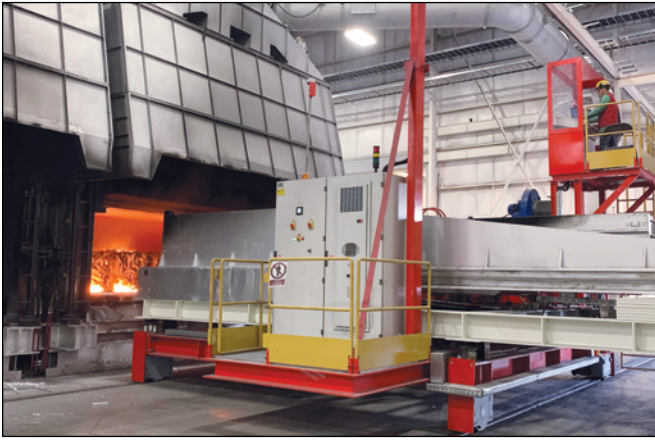
Figure 2. The semi-automated charging machine loads scrap and prime materials into the melting furnace.