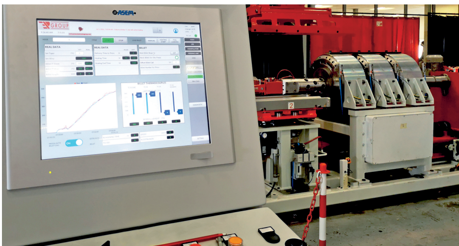
ZPE Permanent Magnet Heater with operator panel

Day by day, Prezezzi Extrusion Group demonstrates its commitment to handing over a better world to future generations: the constant search for innovative and sustainable technological solutions, and the obtainment of these certifications, are further proof of this.