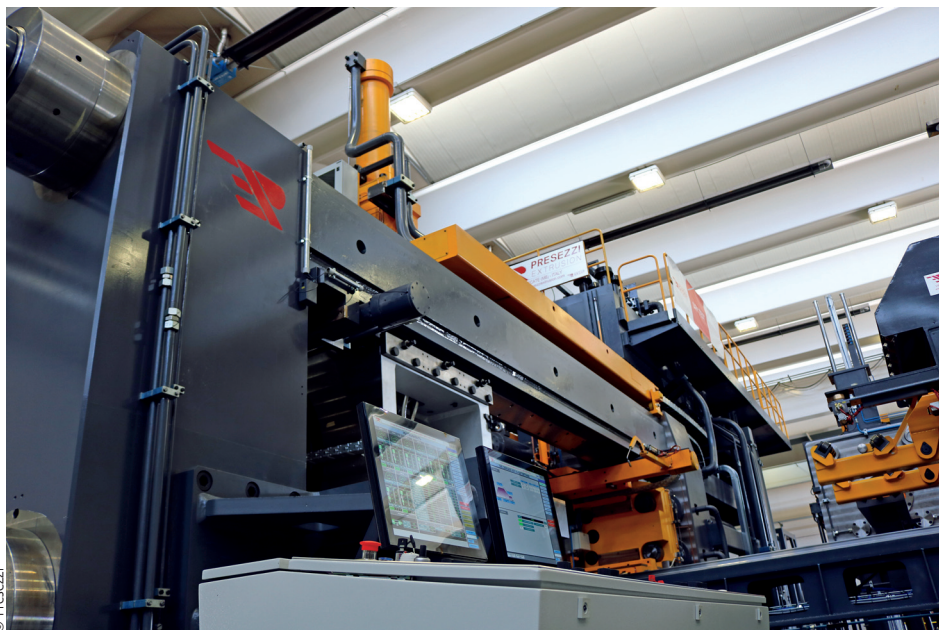
Presezzi extrusion press

Presezzi Extrusion Group has proven experience in the production and commissioning of extrusion lines for non-ferrous metals, particularly in the aluminium field. The company was founded 30 years ago as a producer of extrusion presses for aluminium, copper and brass. To date, the Group has published two EPDs for its Permanent Magnet Heater ZPE and its Extrusion Press ESS.