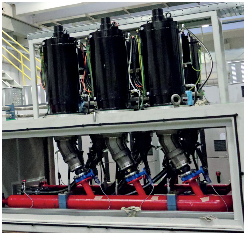
Presezzi Energy Saving System (ESS)

S-P-06355 Permanent Magnet Heater ZPE (Zero Pollution Energy) – an innovative magnetic induction heating system for billets of